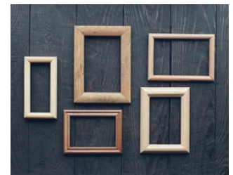
Gallery wall showing a mix of themed pictures and 3d objects.

A simple but effective composition for a small space.